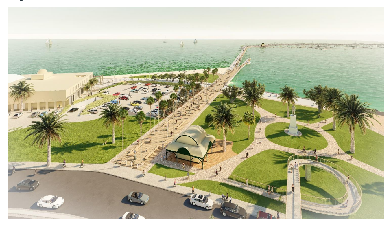
Improved entrance experience and pedestrian connections

In addition to the new pier, Parks Victoria and the Port Phillip City Council will partner in a revitalisation project on the adjoining foreshore. This upgrade will create an iconic visitor entrance to the pier from the St Kilda foreshore precinct and provide a better connection with Catani Gardens to the vibrant St Kilda neighbourhood.