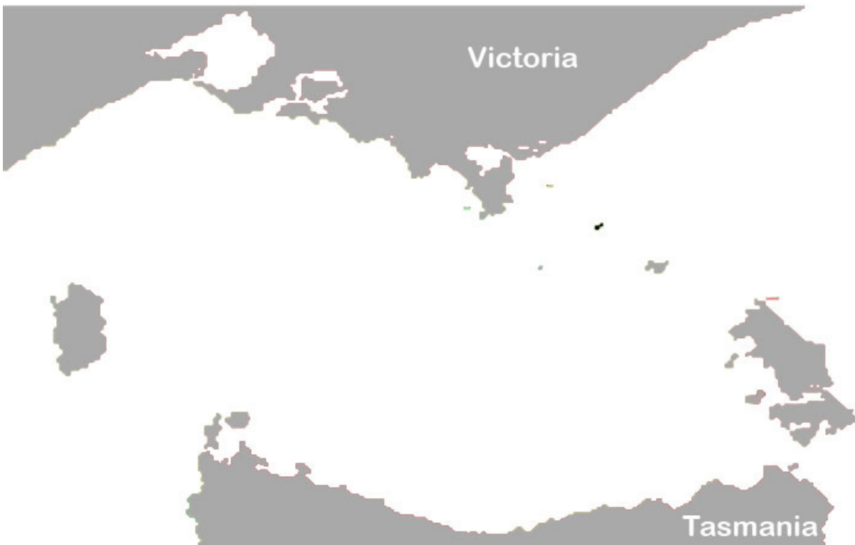
Bass Strait depths outline map

For more information call the Parks Victoria Information Centre on 13 1963 or visit our website - www.parkweb.vic.gov.au