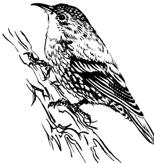
White-throated treecreeper