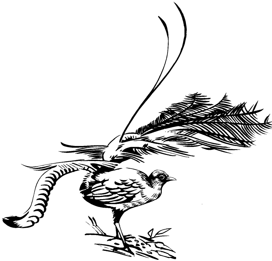
Superb Lyrebird