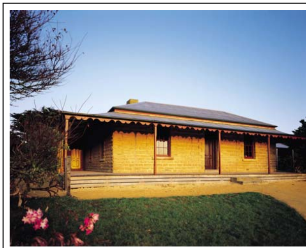
'Glenample' homestead today.

In 1959 Port Campbell moved to support a government decision to establish a National Park. Since the park's establishment in 1964, the town's services and character have increasingly focussed on servicing tourists.