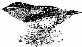
Spotted Pardalote MT ©

Many different types of birds live in the forest. To catch a glimpse, sit or stand quietly as many of the small bush birds can be seen flitting among the shrub layer. As you cross the bridge over the Olinda Creek you may see a Spotted Pardalote racing from bank to bank.