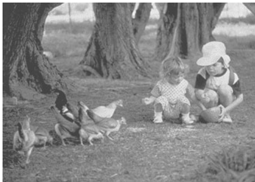
Come and feed the chooks!

Chesterfield Farm (Melway 72 C9) is an ideal place to take the family and experience rural farm life. Watch working dogs, milking and sheep shearing demonstrations in the all-weather show barn. Children can handle common and exotic farm animals in the nursery, feed the chooks and visit the pigs. Farm tours are available.